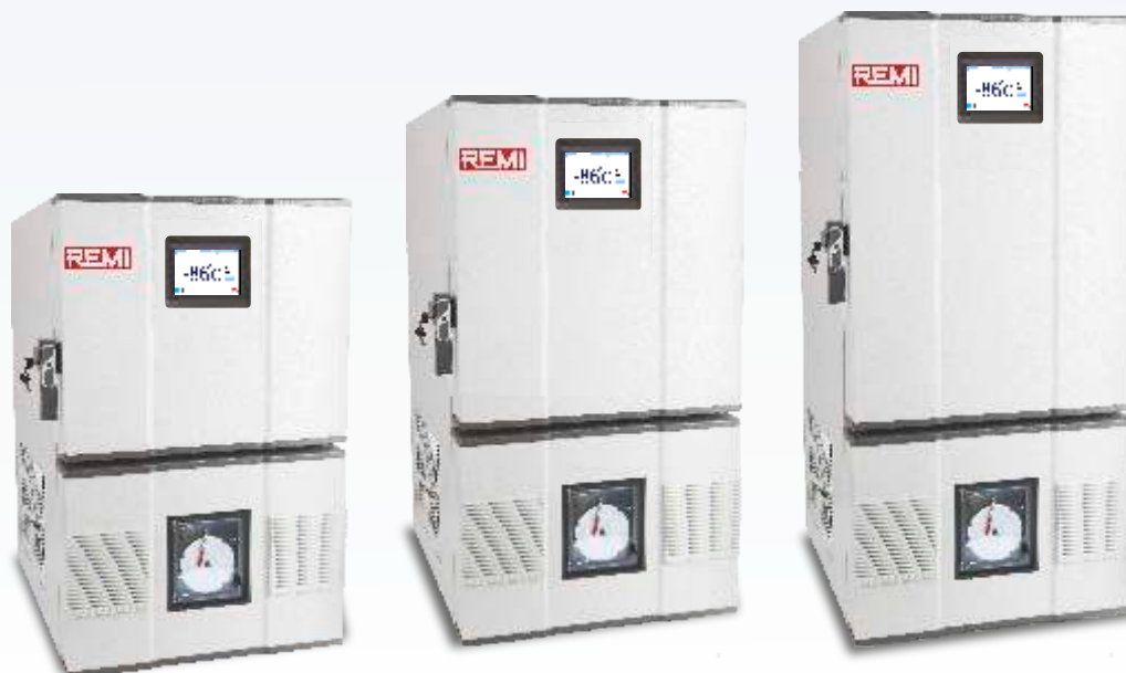
Flexibility to select from 3 available capacities

REMI's new range of ultra-low deep freezer is specially designed for faster temperature pull down & optimized cryopreservation. Highly sensitive microprocessor control ensures precise temperature management at -86°C