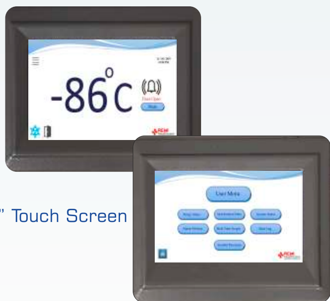
7" Touch Screen