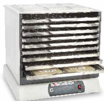
PR 10 Ultra