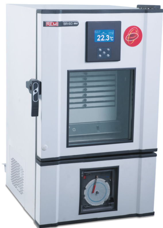
PI 10 Ultra & PR 10 Ultra

In case of temperature controller failure, innovative "Clever-Chip" automatically takes control for continued operations.